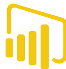
PowerBI Business intelligence