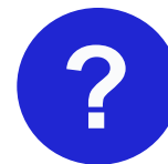
Metadata management & data governance